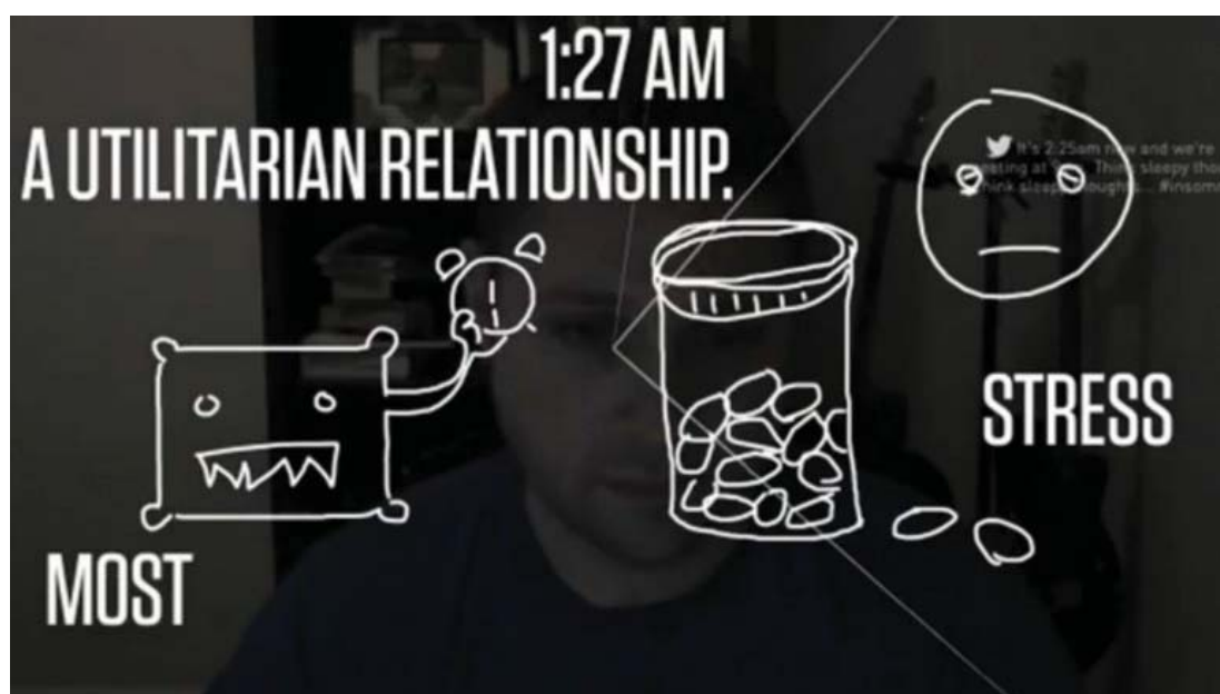
Fig. 3 | Drawings by participants to answer questions about insomnia

The interactive documentary A journal of Insomnia plays with this specific Internet attribute to contradict it, requiring the audience to be online during the night time. In order to give their testimony it is required that participants make a night appointment and receive a call from the National Film Board to guide their participation. On the other end of the line the voice conducts the interview, guiding the participants through the predetermined questions. The answers can be recorded through the computer webcam, typing out text and by drawing sketches.