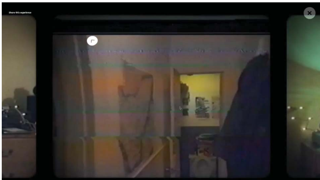
Fig. 2 | Documentary footage with VHS drop-outs

All the images from A Journal of Insomnia are dark, accentuated on a black background, tilting slowly, and interrupted by drop-outs similar to ones we are familiar with from videotape playback. In an interview for The Creators Project, the director of photography Thibaut Duverneix explains that he shot the room images with a Red camera and then transferred the footage to a VHS tape to degrade the look as a way to represent what the subjects' described as their experience of insomnia. Duverneix explains he had some doubts considering the aesthetic: "I was really pushing it far from interactivity. Far from making it look good, honest and intimate" 22 .