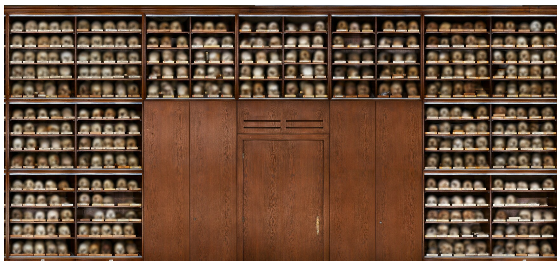
Figure 2. The Skull Cabinet Panorama, detail with doors of the photographic collection, skulls blurred.

ASZ: In the beginning of the project, we used to send a small section of the panorama per email to researchers or the press making inquiries about the project. It was ethically challenging to select a section to send. We decided then to use a section with mainly skulls from Hallstatt (Austria) since the community already paints the skulls and has them displayed in their community's ossuary. Each individual's skull has his/her name written on it, including the date of death and usually beautifully painted flowers. Today, this is a touristic attraction. But I do not like to share the photo in any case, it makes me uncomfortable even if it is blurred.