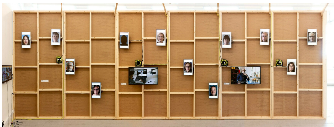
Figure 7. The Dead Images exhibition at the Edinburgh College of Art.