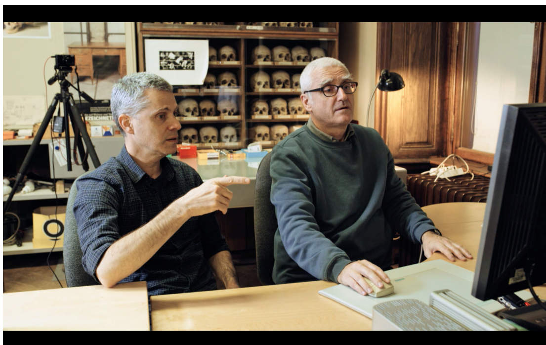
Figure 5. Video-still from the film DARKROOM.

This portrait of Wastl that I show in the film was taken in the same studio setup that we saw in the previous photograph. I can imagine the situation, the proud photographer approaches the chief scientist, his boss: “Herr Wastl, it’s ready, please have a seat, we will photograph you first!”.