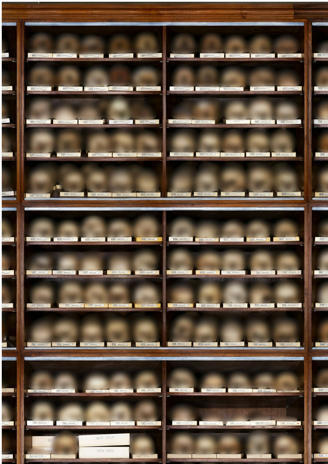
Figure 3. The Skull Cabinet Panorama, detail, skulls blurred.