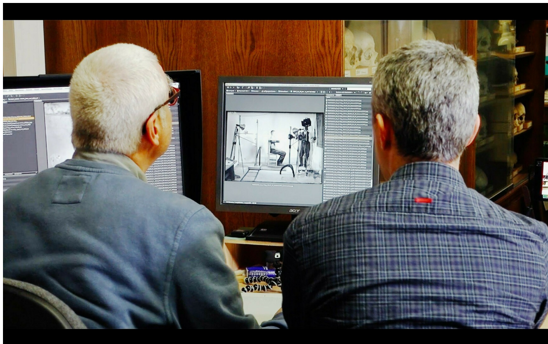
Figure 6. Video-still from the film DARKROOM.